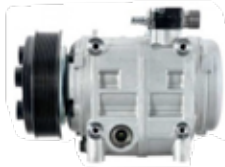
A/C COMPRESSOR SYSTEM 8 KW